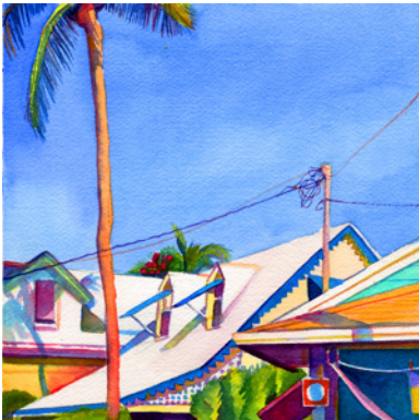
by Susan Abbott