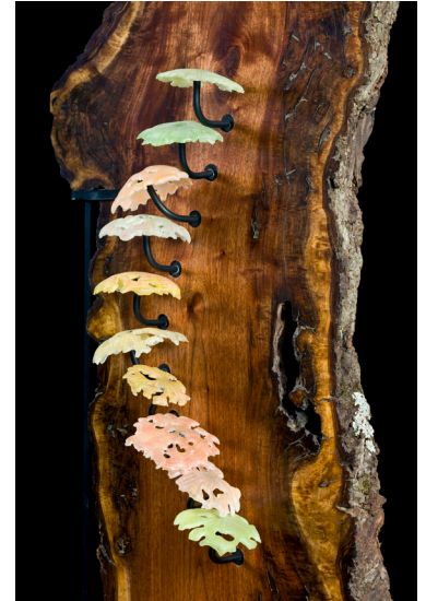
Exhibit dates: January 6 – February 7, 2011

Sigethy works almost exclusively with recycled materials; the majority of her glass comes from the lenses of solar collectors. Dead tree trunks and driftwood collected on her kayaking sojourns are used as anchors for delicate crystalline elements. The use of these salvaged materials reinforces a pervasive theme in Sigethy's work: we, as a culture, generate too much waste. How can we reuse “trash” to create something beautiful?