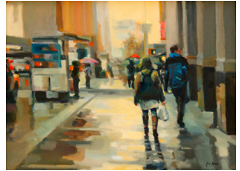
by Jill Banks. Best in Show, 2010 'Scapes Exhibit.