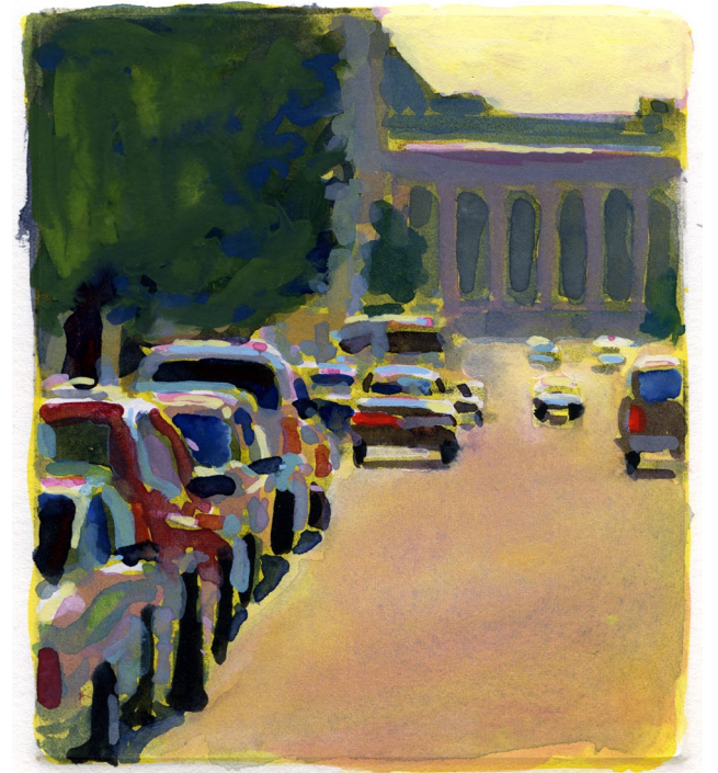
monotype by Mike Francis

Novices and experienced artists alike discover the exciting artistic potential of post-consumer recyclable plastics as they work with guest artist David Edgar. Creating sculptures from these materials is fun and results in lightweight, colorful, unique artworks. Orientation to materials and equipment, demonstration of fundamental techniques, and examples of both large and small assembly projects are covered. The goal is to complete two or more pieces daily. Students need to bring their own clean plastic containers and a selection of basic hand tools. This workshop is perfect for school teachers who may be looking for fun projects to do with their students or for Art League members who are looking to create something new and fun for the April "Remains" exhibit! $185. March 26 & 27, 10:00 am-4:00 pm.