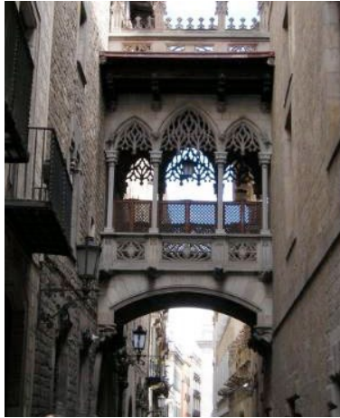
Barcelona: Old Gothic Quarter

$1,330 per person, double occupancy. Limited singles available at an additional charge.