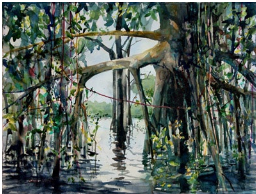
"Strangler Fig Bower, Brazilian Amazon"