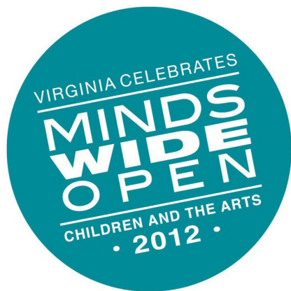
Exhibit Themes for 2012

2012 is the Year of Children and the Arts, a Minds Wide Open initiative organized by the Virginia Commission for the Arts and Virginians for the Arts. The purpose of the initiative is to bring statewide awareness to various art forms, and the importance of the arts in the development and growth of children. In keeping with our mission, "by nurturing the artist we enrich the community," the gallery strives to present programs that give our members an opportunity to stretch as artists. Minds Wide Open programming will take place during the months of March, April, May, and June 2012.