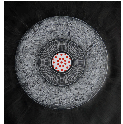
"Red Dots - Circle"

Self-taught artist Shanthy Chandrasekar creates intricate, multi-layered drawings in an attempt to decipher the complicated dreams that inhabit her subconscious. "Red Dots," an exhibition of these pen and ink drawings, will be held in The Art League Gallery, September 8 – October 3, 2011.